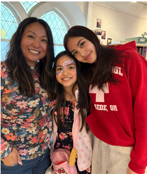
Thanks to all who came together last week for our Easter Egg Hunt & Community Celebration!

But on the first day of the week, at early dawn, they came to the tomb, taking the spices that they had prepared. 2They found the stone rolled away from the tomb, 3but when they went in, they did not find the body. 4While they were perplexed about this, suddenly two men in dazzling clothes stood beside them. 5The women were terrified and bowed their faces to the ground, but the men said to them, ‘Why do you look for the living among the dead? He is not here, but has risen. 6Remember how he told you, while he was still in Galilee, 7that the Son of Man must be handed over to sinners, and be crucified, and on the third day rise again.’ 8Then they remembered his words, 9and returning from the tomb, they told all this to the eleven and to all the rest. 10Now it was Mary Magdalene, Joanna, Mary the mother of James, and the other women with them who told this to the apostles. 11But these words seemed to them an idle tale, and they did not believe them. 12But Peter got up and ran to the tomb; stooping and looking in, he saw the linen cloths by themselves; then he went home, amazed at what had happened.